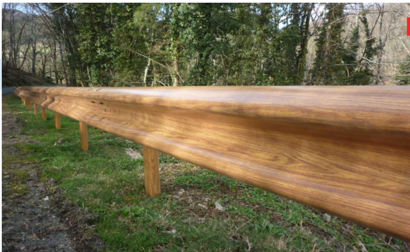
EURO GS N2 System with powder coated wood design – Full design set available on request