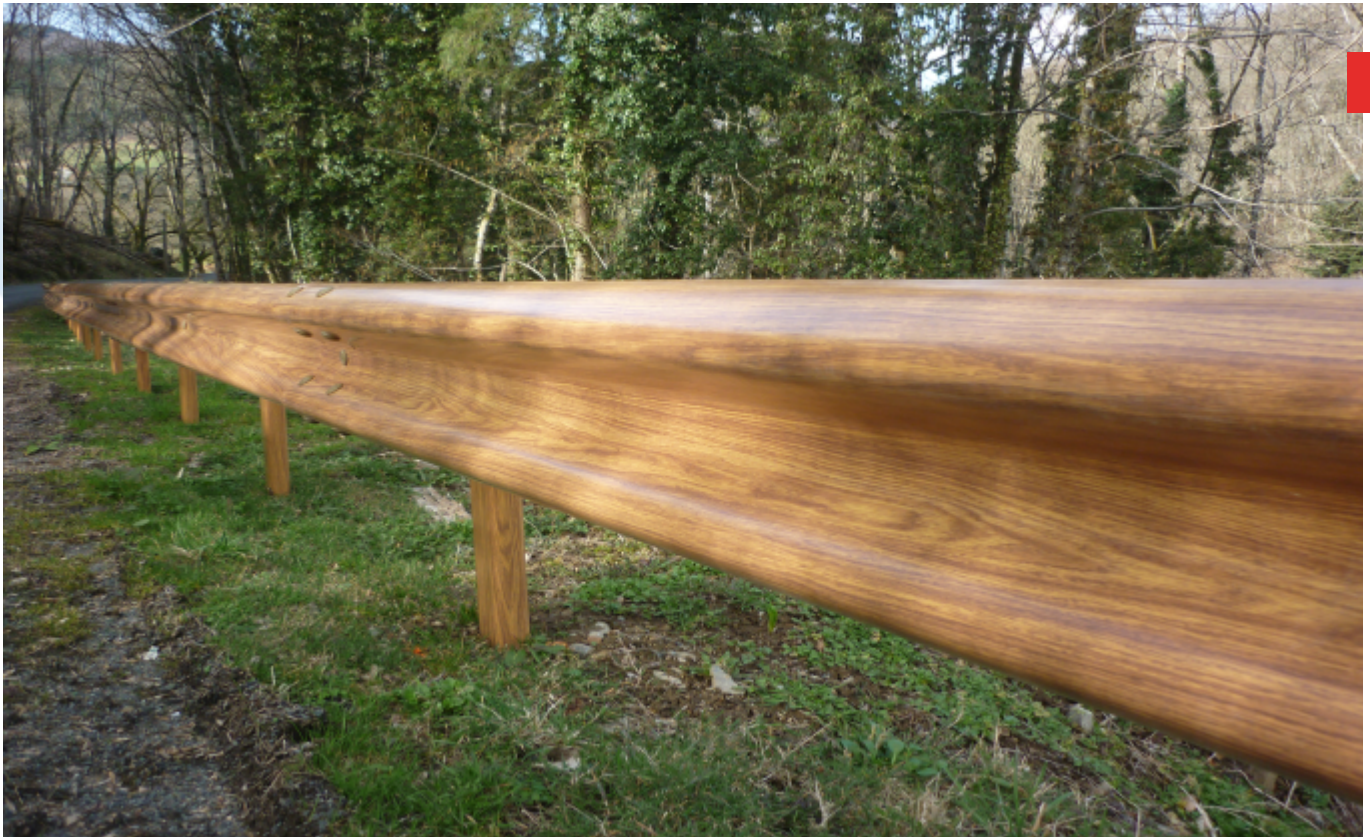
Système Euro GS N2 thermolaqué décor bois - une palette de décors est disponible sur demande